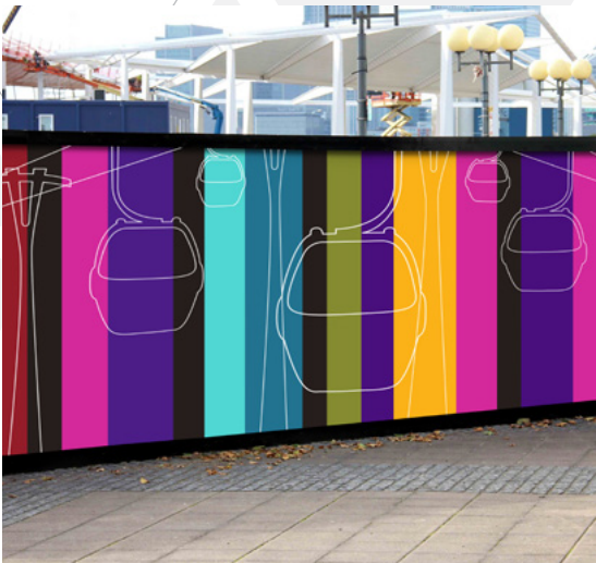
Wrapped in DPF 4500GT with Series 3350 Overlaminate