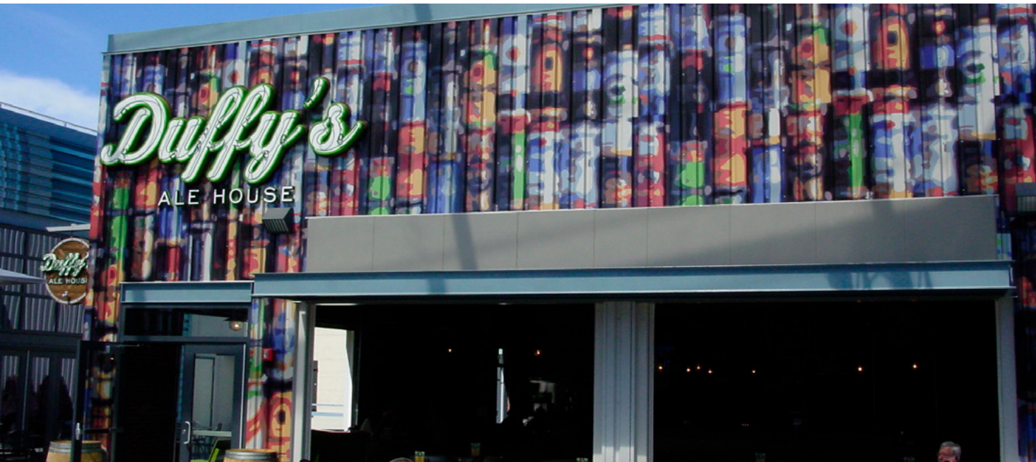
Wrapped in DPF 6000RP White with Series 3210 Overlamine by Graphics Unlimited