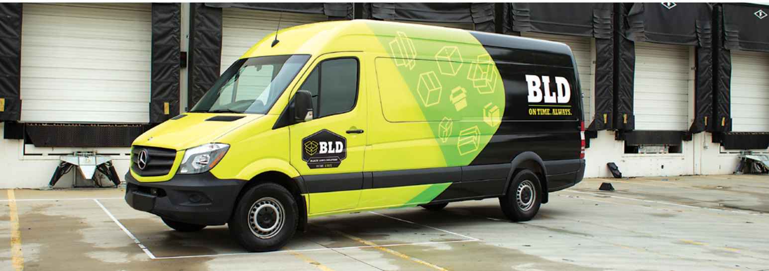
Wrapped in SLX™ Cast Wrap with Series 3270 Overlaminate by OC Wraps