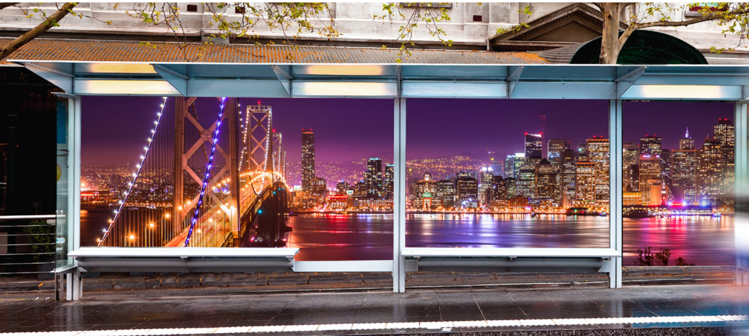
Wrapped in DPF 510G