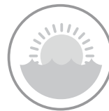
Temperature & Chemical Resistance