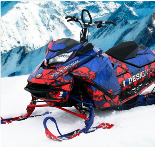
Wrapped in DPF 8000™ White with Series 3590 Overlaminate by T2 Design

Whether your graphics are going cross country, transatlantic or just across town, you will need a film to withstand the extremes.