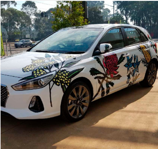
Wrapped in SLX™ Cast Wrap with Series 3270 Overlaminates by Selmor Displays