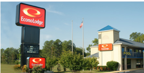
Wrapped in DPF 6500