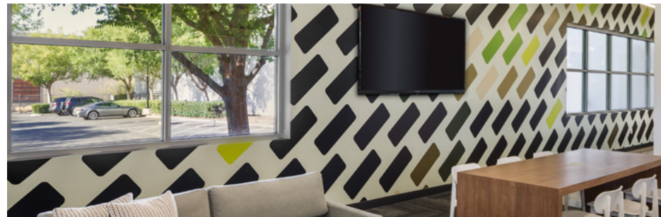
Wrapped in DPF 6000RP White