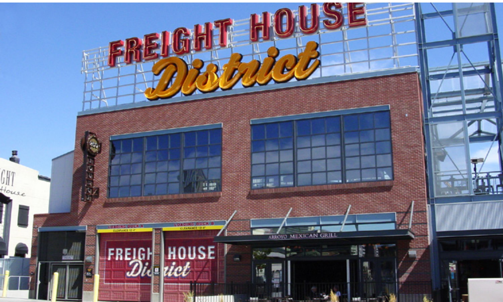
Wrapped in DPF 6000RP White with Series 3220 Overlaminate by Graphics Unlimited