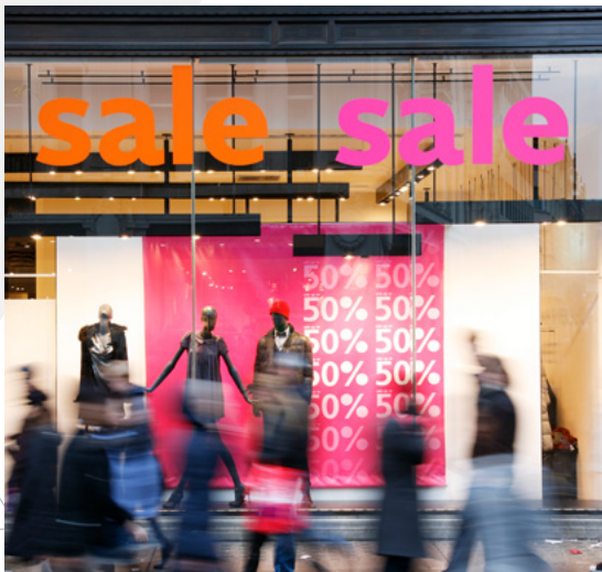
DPF 50WD White

Low cost solutions can still turn heads and these films are designed to do just that for your everyday promotional graphics.