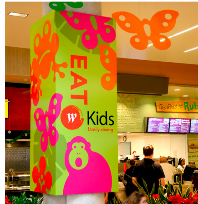
Wrapped in DPF 4500G White with Series 3420 Overlamine