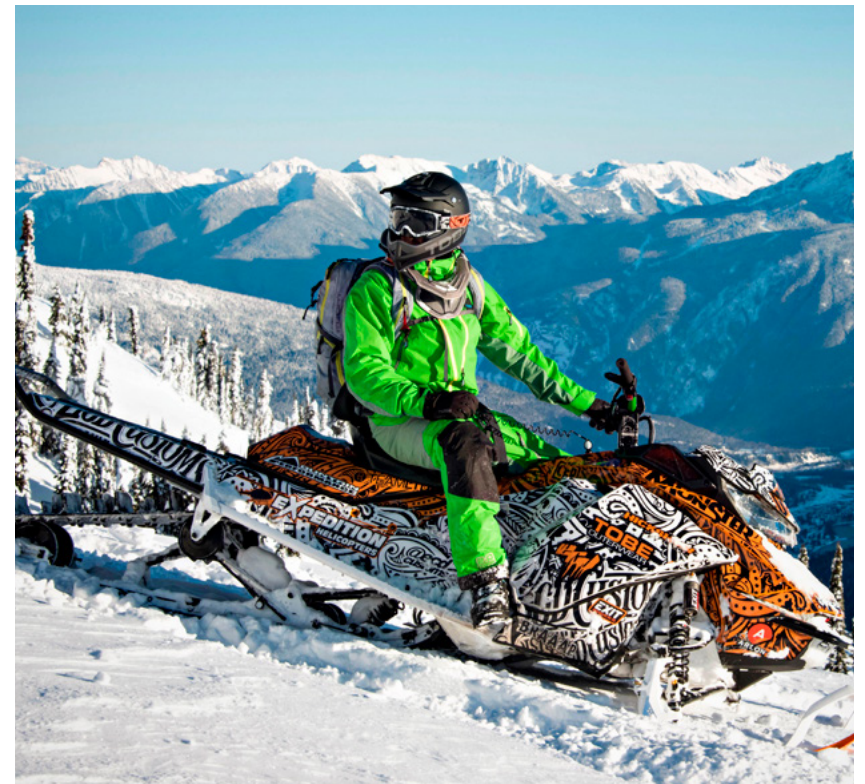
Wrapped in DPF 8000™ White with Series 3590 Overlaminate by ECD Customs