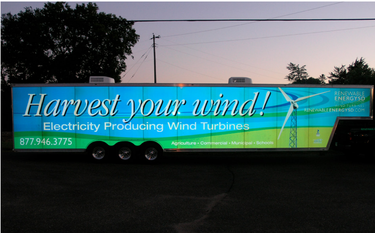
Wrapped in DPF 2400 with Series 3200 Overlaminate by Transport Graphics