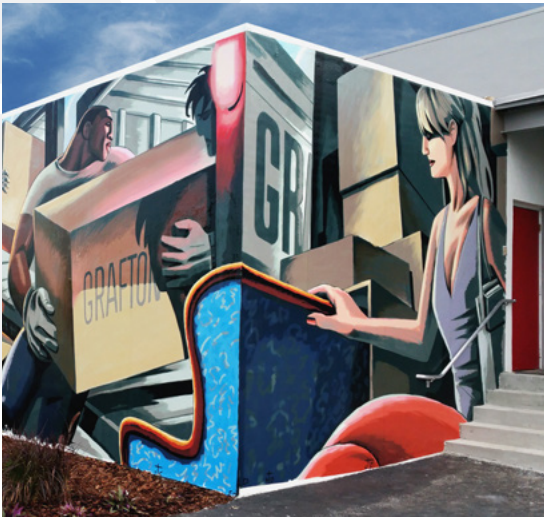
Wrapped in DPF 6700 by Signs Now Broward

Transform ordinary walls into personalized art tailored to each individual customer.