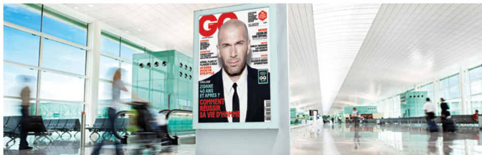
Wrapped in DPF 4500GLX