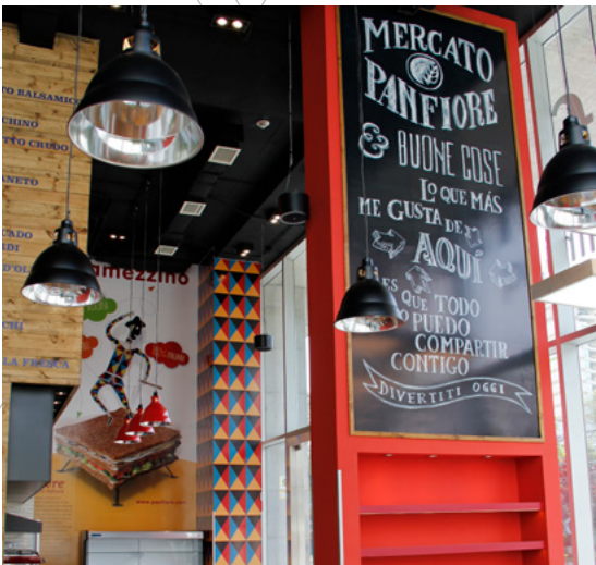
Wrapped in DPF 8000™ White by Mislé & Saez

This collection features our most versatile films allowing you to use them for multiple applications while maximizing profitability.