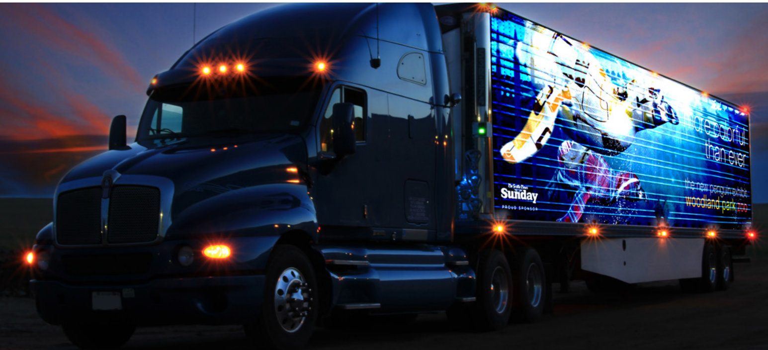
Wrapped in DPF 2400 with Series 3200 Overlamineate