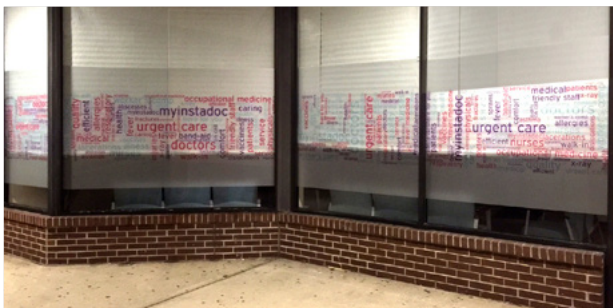
Wrapped in DPF 5200