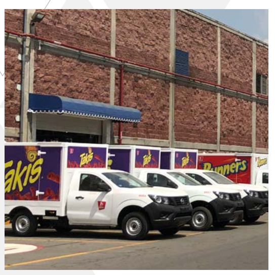
Wrapped in DPF 4600GLX by Moldex

Providing you with end-to-end solutions that keep efficiency and price point in mind.