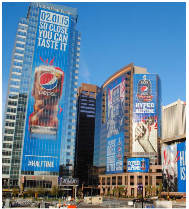
Wrapped in DPF 8200 High Tack