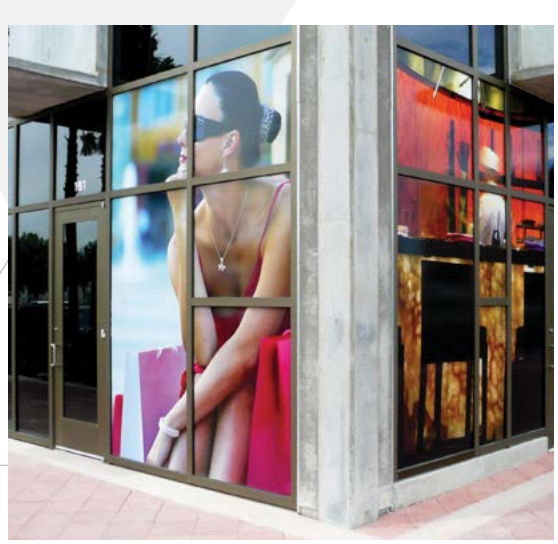
Wrapped in DPF 510GTR

Low cost solutions can still turn heads and these films are designed to do just that for your everyday promotional graphics.