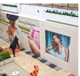
1 Wrapped in DPF 4600GLX; 2 Wrapped in DPF 6000RP Clear; 3 Wrapped in DPF 6500; 4 Wrapped in DPF 4500GT