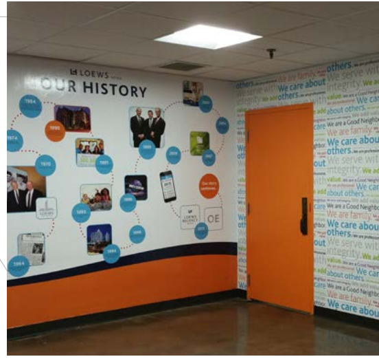
Wrapped in DPF 6700 by 12-Point Signworks