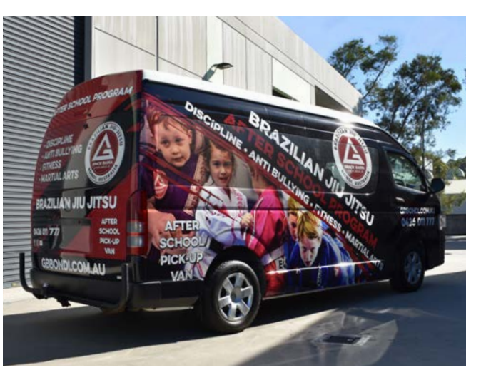
Wrapped in SLX™ Cast Wrap with Series 3270 Overlaminate by Blurred Sign Co.