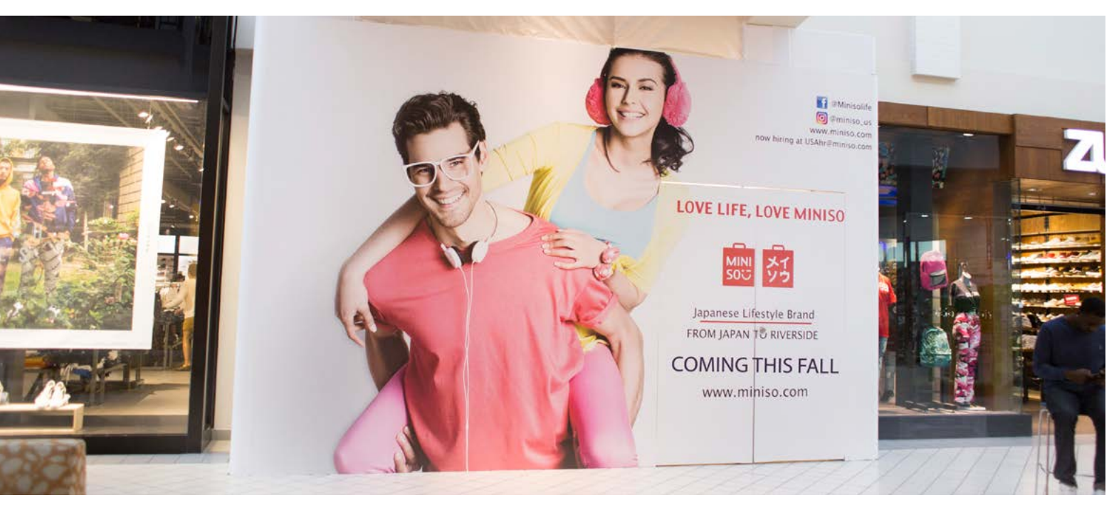
Wrapped in DPF 510GT-HT