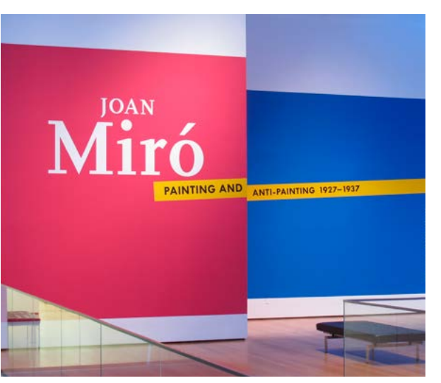
Wrapped in DPF 6700 with Series 3220 Overlaminate by Signs Now Broward