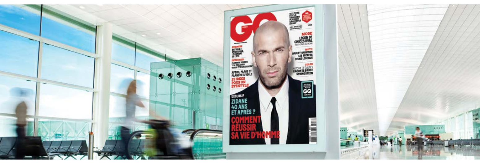
Wrapped in DPF 4500GLX