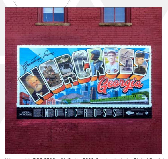
Wrapped in DPF 6700 with Series 3220 Overlaminate by Digital Precision

Shield and protect your everyday signage from the elements. Arlon overlaminates are designed to protect and prolong the life of your graphic.