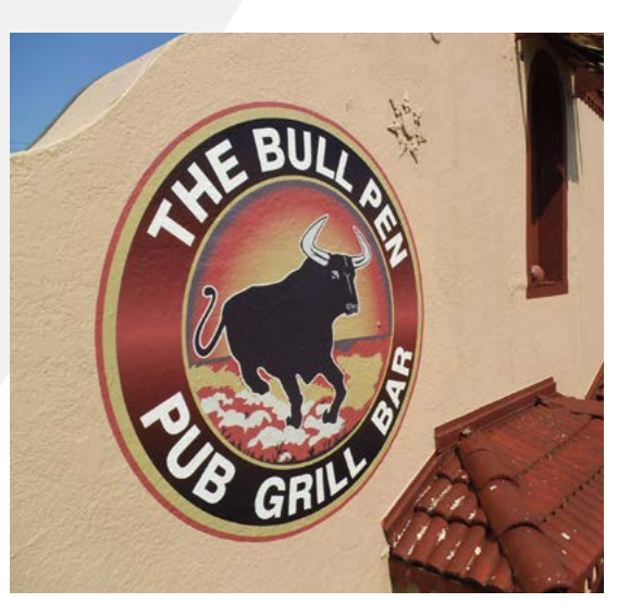
Wrapped in DPF 8000™ Ultra Tack by Industry Graphics

Transform hard-to-stick brick, concrete and stucco into larger than life graphics. From the window to the walls, no surface is left untouched.