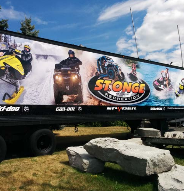
Wrapped in Fusion Wrap with Series 3170 Overlaminate